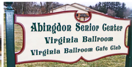
The Abingdon Senior Center is where we meet for breakfast