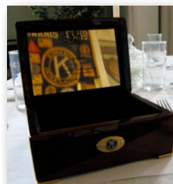
Gary's Rosewood Box With Engraved Plate